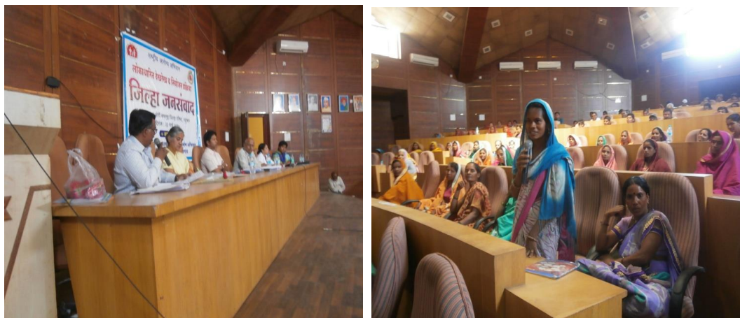
District level Jan Samvad

The Arogya Sabhapati and The District Health Officer promised to follow up these points.