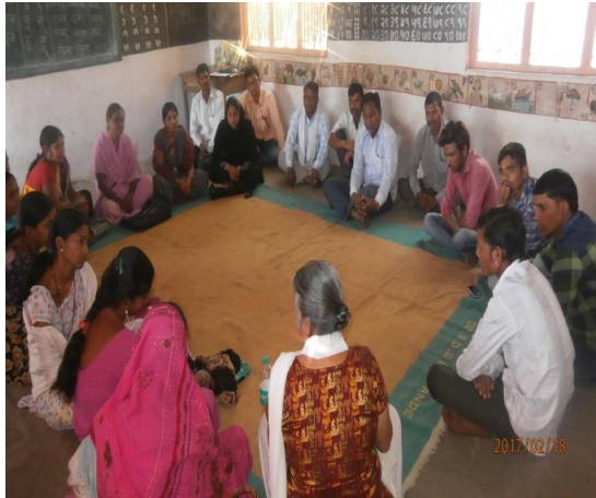
Mahasamiti preparatory meeting