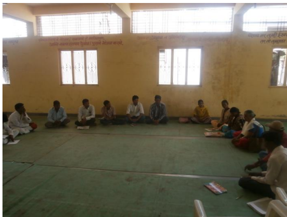
Follow up meeting on 8 th March 2017