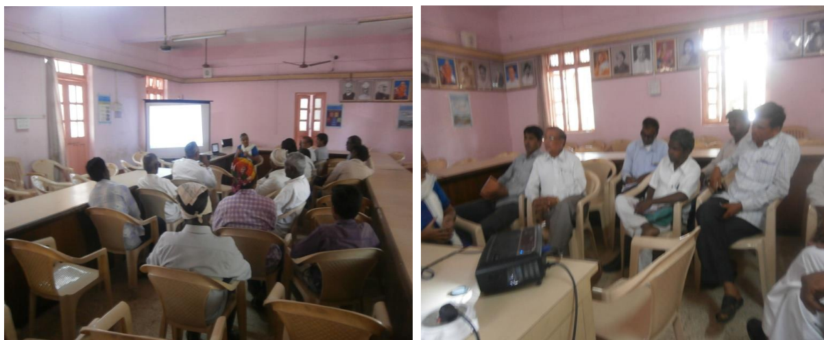
Shahada Block level GRC Cell Training Workshop