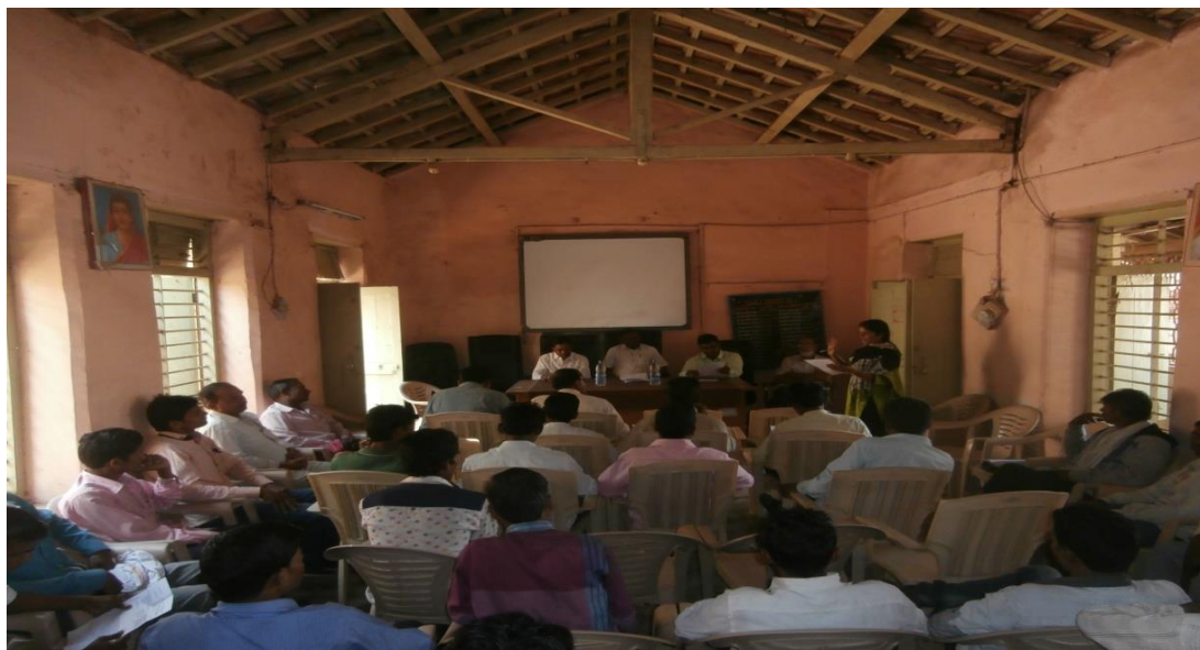
Block level committee Meeting

The above points were put forward and discussed in the Block level committee.