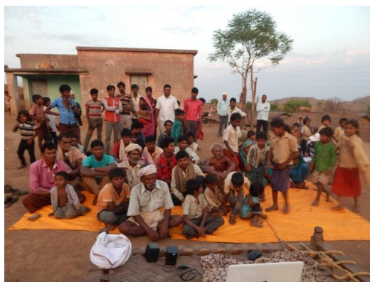
Pada Meeting in Nambar Pada of Nagziri village