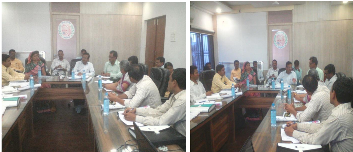
District Mentoring Committee Meeting