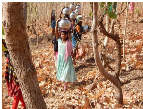
Vanbhajya/Ranbhayajya Mahotsav Nagaziri