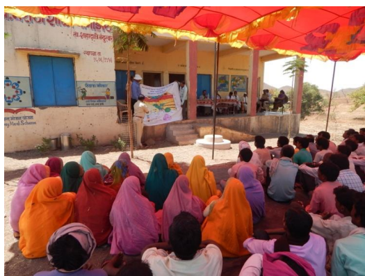
Gramsbha of Nagziri with Govt. officials

In April 2016, Gramsabhas were organized by Nagazari and Kotbandhani villages. In these Gramsabhas, Janarth AVS was given responsibility of supporting them in Management of Community forest which is around 6000 Hectors. After that Gramsabha, we organized meetings in padas (hamlets). It was found that Forest Department had used a method for Conservation of forest wherein it has given responsibilty of some area to local Karbharies (Pada Leaders) .Now the responsibility of protection and development of community forest lies with people. Now the challenge for us is to study how much diversity is there in that small area and how it would coninue with participation of all people.