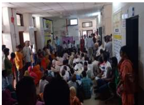
PWMIs and caretakers meeting at Dhadgaon OPD

There was shortage of medicine for 3-4 months. The gap in taking medicine has serious effects and the recovery affects. There is possibility of relapsing of the mental illness. Therefore to address the problem of shortage of medicines, a memorandum with signatures of PWMIs and caretakers was given to the Civil Surgeon of Nandurbar Civil Hospital. Meanwhile Janarth Sanstha purchased medicines of Rs. 7,000/- and distributed the same at the time of OPD with help of DMHP staff.